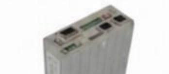
High-Efficiency Heat Transfer Tube

The unit features a 10.4-inch high-resolution touch screen with user-friendly interface. All parameters and historical fault information of the compressor and the chiller can be displayed and queried. Multi-language display; the interface is clear and intuitive.